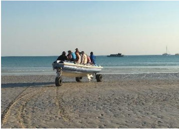
Tender and the Contessa C in the background

Early start to the day, 0700, picked up from my accommodation and went to the southern end of Cable Beach near Gantheaume Point which is where the majority of mooring points are for numerous types of vessels and charters. No jetty and only beach launch. The tender to take us to the Contessa C was a Zodiac with collapsable balloon wheels, quite an amazing sight and didn't even get our feet wet. An experience in itself